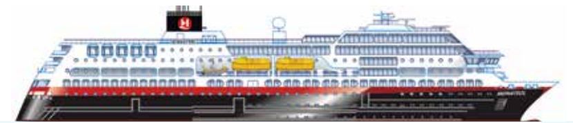
DECK 9 DECK 8 DECK 7 DECK 6 DECK 5 DECK 4 DECK 3

The name Midnatsol (Midnight Sun) is something to live up to, and this ship, dedicated to the Norwegian summer, does just that. The interior's bright, colourful décor is inspired by the warm sunny climate, a motif also reflected in the many pieces of Norwegian modern art on display. MS Midnatsol was put into service on 15 April 2003 and is the fourth Hurtigruten ship to bear this name. The ship has a strong environmental profile and a modern design, with Norwegian materials used extensively throughout its interiors. Together with her sister ship, MS Trollfjord, MS Midnatsol is among the newest in the fleet.